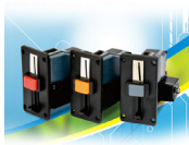
Coin Acceptor UCA2