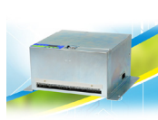
Note Dispenser NDE-1000