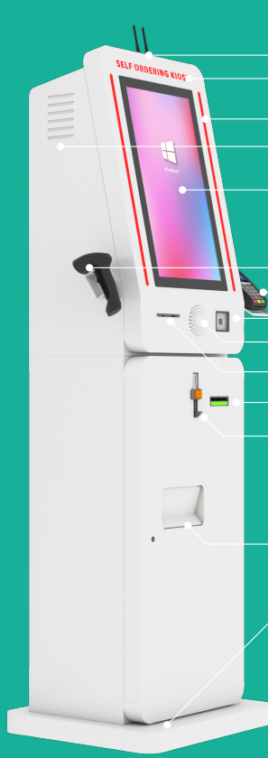
Cash Acceptable Version