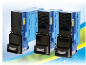
Bill Acceptor XBAm-EV

Standard device option for self-service kiosk system