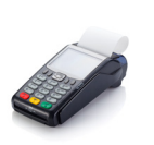
EDC POS Terminal