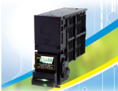
Bill Acceptor V77E