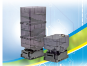
Coin Hopper MH-125A