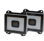
QR-Code Scanner NLS-EM20-85